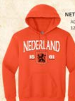
NETHERLANDS ESTABLISHED ADULT HOODED SWEATSHIRT 1260 ASH