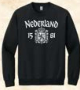
NEDERLAND CREST 1581 ADULT SWEATSHIRT 1256 AS