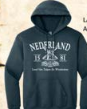
LAND OF TULIPAN AND WINDMILLS ADULT HOODED SWEATSHIRT