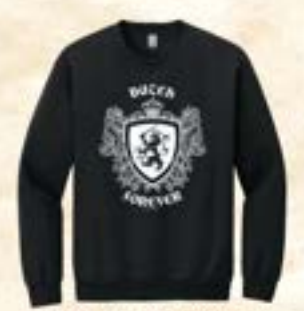
DUTCH COAT OF ARMS ADULT SWEATSHIRT 1253 AS