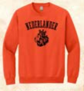
ORANGE DUTCH LION ADULT SWEATSHIRT 1291 AS