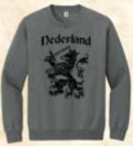
NETHERLANDS LION (distressed) ADULT SWEATSHIRT 1261 AS