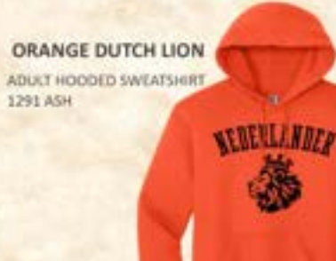
ADULT HOODED SWEATSHIRT