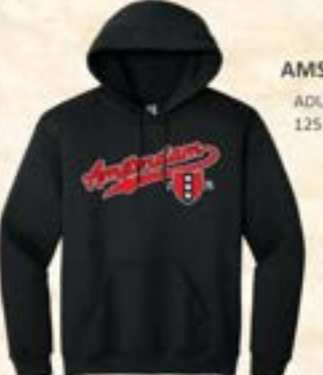
AMSTERDAM SHIELD ADULT HOODED SWEATSHIRT 1251 ASH

Kangaroo-style front pocket is perfect for your phone, keys or anything else you want to stash. 50% cotton (up to 7.7% reclaimed), Ribbed cuffs and waist hem, Adjustable drawstring hood