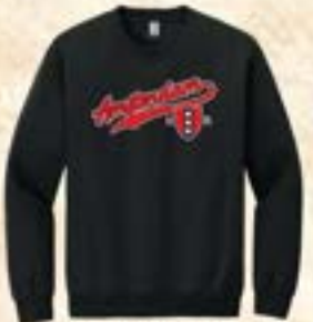
AMSTERDAM SHIELD ADUCT SWEATSHIRT

Display national pride with these unique custom designs screen onto 50% pre-shrunk cotton/50% polyester, Weight: 7.75 oz, Pill-resistant, 1X1 Lycra* spandex ribbed collar, cuffs and waist, Fully double-stitched