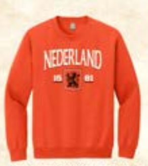
NETHERLANDS ESTABLISHED ADULT SWEATSHIRT 1260 AS