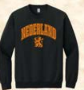
NETHERLANDS COLLEGIATE ADULT SWEATSHIRT