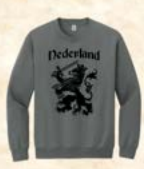
NETHERLANDS LION (solid) ADULT SWEATSHIRT