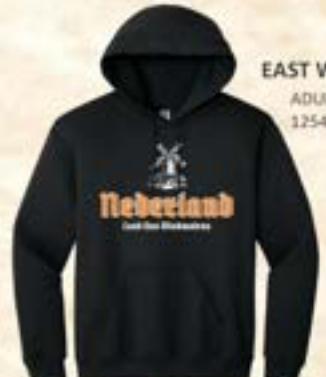
EAST WEST HOME IS BEST ADULT HOODED SWEATSHIRT 1254 ASH