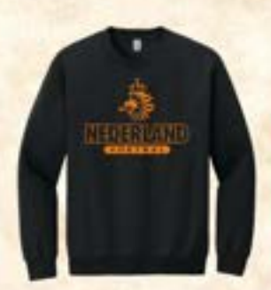
NETHERLANDS SOCCER ADULT SWEATSHIRT