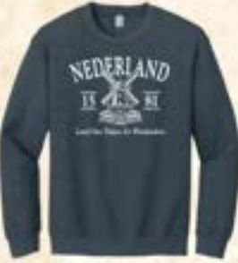
AND OF TULIPAN AND WINDMILLS ADULT SWEATSHIRE