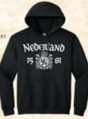
NEDERLAND CREST 1581 ADULT HOODED SWEATSHIRT 1255 ASH